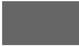
METRO BROWN QC 8228