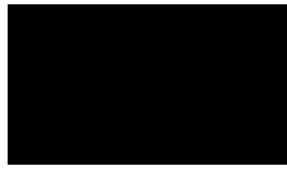
BLACK QC 8262