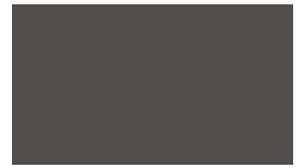
DARK BROWN QC 8229