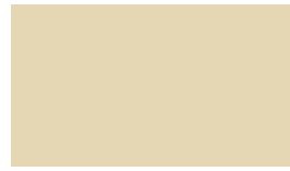
ANTIQUÉ LINEN QC 8696