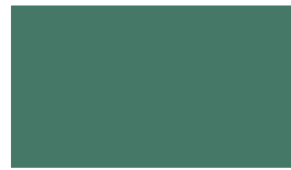
FOREST GREEN QC 8329