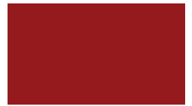
BRIGHT RED QC 8386