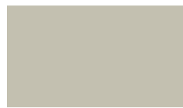
BONE WHITE QC 8273