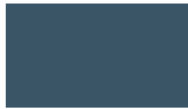
HERON BLUE QC 8330