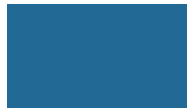
ROYAL BLUE QC 8790