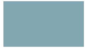
SAPPHIRE BLUE QC 8261